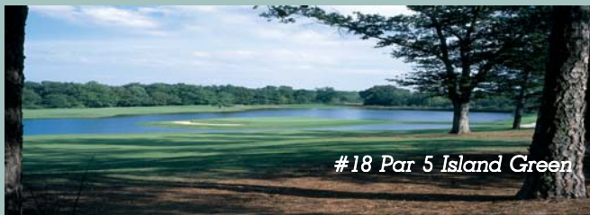
#18 Par 5 Island Green